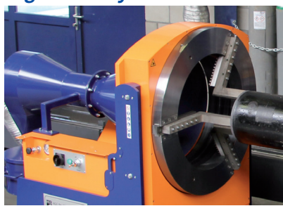
The self-centring three jaw chuck is one of the factors influencing accuracy. It achieves high accuracy by clamping pipes securely, avoiding slip and creep (longitudinal movement) during rotation.